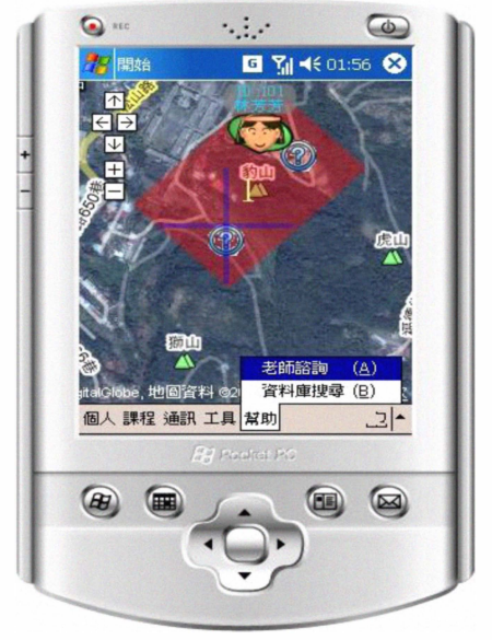
FIG 3. AN EXAMPLE OF INSTRUCTION GUIDANCE VIA THE PDA.

Handheld interface: Creating a ubiquitous learning environment is one of the critical aspects of this study. During the problem solving process, students may need to go to the remote site for field study or collect evidences, and keep in touch with teammates and receive guidance from instructor are very important. Mobile handheld device provides a real experience opportunity to students to enjoy "learning by doing" in remote location and also keep connecting with each other. Figure 3 shows that instructor can provide timely assistant to students via the PDA and students also search build-in database for related issues and topics.